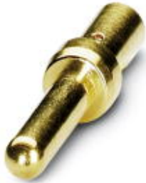
Crimp contact, turned, Single contact, Contact diameter: 1 mm, Crimp range: 0.5 mm 2 ...1 mm 2

Please be informed that the data shown in this PDF Document is generated from our Online Catalog. Please find the complete data in the user's documentation. Our General Terms of Use for Downloads are valid ( http://phoenixcontact.com/download )