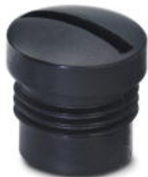
M12 screw plug for the unoccupied M12 sockets of the sensor/actuator cable, boxes and flush-type connectors, packing unit containing 1000 pieces

Please be informed that the data shown in this PDF Document is generated from our Online Catalog. Please find the complete data in the user's documentation. Our General Terms of Use for Downloads are valid ( http://phoenixcontact.com/download )