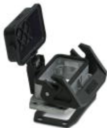
HEAVYCON panel mounting base, B10, with single locking latch, with plastic protective cover, with flat gasket, salt-water-resistant aluminum, conductive profile gasket.

Please be informed that the data shown in this PDF Document is generated from our Online Catalog. Please find the complete data in the user's documentation. Our General Terms of Use for Downloads are valid ( http://phoenixcontact.com/download )