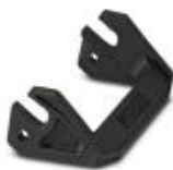
Single locking latch for B10 housing, HC-EVO....AL and HC-STA....AL

Replacement part - HC-STA-B10-SL-PLBK - 1412804