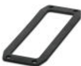
Replacement flat gasket, for HEAVYCON panel mounting base, HC-STA....AL, type B10, conductive