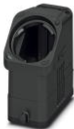
HEAVYCON EVO sleeve housing, plastic, with bayonet flange for EVO screw connection, D15 series, for single locking latch, height: 65.5 mm, without EVO screw connection

Please be informed that the data shown in this PDF Document is generated from our Online Catalog. Please find the complete data in the user's documentation. Our General Terms of Use for Downloads are valid ( http://phoenixcontact.com/download )