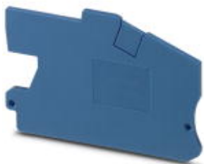
End cover, Length: 66.3 mm, Width: 2.2 mm, Color: blue

Please be informed that the data shown in this PDF Document is generated from our Online Catalog. Please find the complete data in the user's documentation. Our General Terms of Use for Downloads are valid ( http://phoenixcontact.com/download )