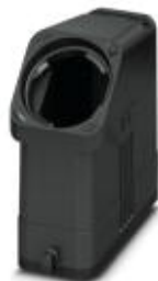
HEAVYCON EVO sleeve housing, plastic, bayonet flange for EVO screw connection, D25 series, for single locking latch, height: 75.5 mm, without EVO screw connection

Please be informed that the data shown in this PDF Document is generated from our Online Catalog. Please find the complete data in the user's documentation. Our General Terms of Use for Downloads are valid ( http://phoenixcontact.com/download )