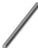
Connection pin, Length: 1000 mm, Color: gray