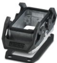
HEAVYCON B10 panel mounting base, with double locking latch, with flat gasket, salt-water-resistant aluminum, conductive profile gasket

Please be informed that the data shown in this PDF Document is generated from our Online Catalog. Please find the complete data in the user's documentation. Our General Terms of Use for Downloads are valid ( http://phoenixcontact.com/download )