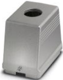
HEAVYCON sleeve housing B48, for single locking latch, height 96 mm, with thread 1x M32, straight conductor exit

Please be informed that the data shown in this PDF Document is generated from our Online Catalog. Please find the complete data in the user's documentation. Our General Terms of Use for Downloads are valid ( http://phoenixcontact.com/download )