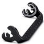
Replacement plastic single locking latch for standard housings of type B24