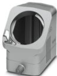
HEAVYCON EVO sleeve housing, EMC version, without powder coating, with bayonet flange for EVO screw connection, B10, for single locking latch, height: 64 mm, without EVO screw connection.

Please be informed that the data shown in this PDF Document is generated from our Online Catalog. Please find the complete data in the user's documentation. Our General Terms of Use for Downloads are valid ( http://phoenixcontact.com/download )