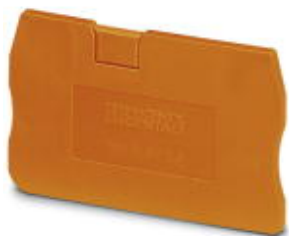
End cover, Length: 48.5 mm, Width: 2.2 mm, Height: 36.5 mm, Color: orange

Please be informed that the data shown in this PDF Document is generated from our Online Catalog. Please find the complete data in the user's documentation. Our General Terms of Use for Downloads are valid ( http://phoenixcontact.com/download )