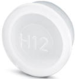
Plastic dust protection cap for connectors with M23 external thread

Please be informed that the data shown in this PDF Document is generated from our Online Catalog. Please find the complete data in the user's documentation. Our General Terms of Use for Downloads are valid ( http://phoenixcontact.com/download )