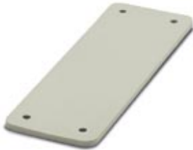
HEAVYCON cover plate, for panel cutouts of type B16/HV6, 3.5 mm thick, gray

Please be informed that the data shown in this PDF Document is generated from our Online Catalog. Please find the complete data in the user's documentation. Our General Terms of Use for Downloads are valid ( http://phoenixcontact.com/download )