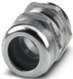
Cable gland, Cable gland material: Brass, nickel-plated, External cable diameter 18 mm ... 25 mm, Shielding: No, Connecting thread: Pg29, Color: silver

Please be informed that the data shown in this PDF Document is generated from our Online Catalog. Please find the complete data in the user's documentation. Our General Terms of Use for Downloads are valid ( http://phoenixcontact.com/download )