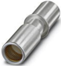
Crimp contact, turned, Contact diameter: 10 mm, Crimp range: 50 mm 2 ...50 mm 2

Please be informed that the data shown in this PDF Document is generated from our Online Catalog. Please find the complete data in the user's documentation. Our General Terms of Use for Downloads are valid ( http://phoenixcontact.com/download )