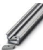
DIN rail, deep drawn, high profile, unperforated, 1.5 mm thick, material: aluminum, height 15 mm, width 35 mm, length 2000 mm

DIN rail, unperforated - NS 35/15 AL UNPERF 2000MM - 1201756