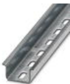
DIN rail, material: Galvanized, perforated, height 15 mm, width 35 mm, length: 2 m

DIN rail perforated - NS 35/15 ZN PERF 2000MM - 1206599