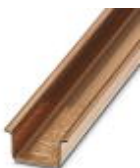
DIN rail, material: Copper, unperforated, 1.5 mm thick, height 15 mm, width 35 mm, length: 2 m

DIN rail, unperforated - NS 35/15 CU UNPERF 2000MM - 1201895