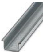
DIN rail, material: Galvanized, unperforated, height 15 mm, width 35 mm, length: 2 m

DIN rail, unperforated - NS 35/15 ZN UNPERF 2000MM - 1206586