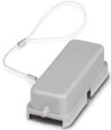
HEAVYCON protective cover, type D25, for supporting base element with single locking latch, with retaining cord, IP54, PA

Please be informed that the data shown in this PDF Document is generated from our Online Catalog. Please find the complete data in the user's documentation. Our General Terms of Use for Downloads are valid ( http://phoenixcontact.com/download )