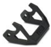
Single locking latch for B6 housing, HC-EVO...AL and HC-STA...AL

Replacement part - HC-STA-B06-SL-PLBK - 1412591