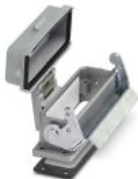
HEAVYCON panel mounting base D25, with single locking latch, height 26 mm, with cover

Please be informed that the data shown in this PDF Document is generated from our Online Catalog. Please find the complete data in the user's documentation. Our General Terms of Use for Downloads are valid ( http://phoenixcontact.com/download )