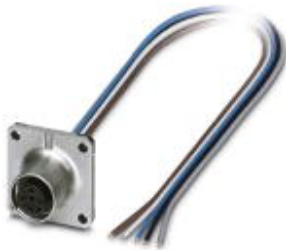
Sensor/Actuator flush-type socket, 5-pos., M12, A-coded, front/square flange mounting, with 0.5 m TPE litz wire, 5 x 0.34 mm 2

Please be informed that the data shown in this PDF Document is generated from our Online Catalog. Please find the complete data in the user's documentation. Our General Terms of Use for Downloads are valid ( http://phoenixcontact.com/download )