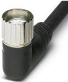
Socket M23, 19-pos., angled, shielded, with shielded, connected master cable, length: 5 m

Please be informed that the data shown in this PDF Document is generated from our Online Catalog. Please find the complete data in the user's documentation. Our General Terms of Use for Downloads are valid ( http://phoenixcontact.com/download )