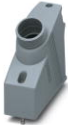
Plastic sleeve housing, locking screws with cylindrical head, type 3, cable screw connection Pg21

Please be informed that the data shown in this PDF Document is generated from our Online Catalog. Please find the complete data in the user's documentation. Our General Terms of Use for Downloads are valid ( http://phoenixcontact.com/download )