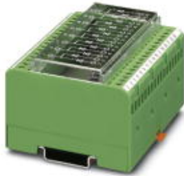
Lamp test module, 2 diodes with common cathode: with 8 pairs, for individual wiring

Please be informed that the data shown in this PDF Document is generated from our Online Catalog. Please find the complete data in the user's documentation. Our General Terms of Use for Downloads are valid ( http://phoenixcontact.com/download )