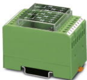
Lamp test module, 2 diodes with common cathode: with 4 pairs, for individual wiring

Please be informed that the data shown in this PDF Document is generated from our Online Catalog. Please find the complete data in the user's documentation. Our General Terms of Use for Downloads are valid ( http://phoenixcontact.com/download )