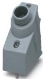
Plastic sleeve housing, locking screws with cylindrical head, type 1, cable screw connection Pg16

Please be informed that the data shown in this PDF Document is generated from our Online Catalog. Please find the complete data in the user's documentation. Our General Terms of Use for Downloads are valid ( http://phoenixcontact.com/download )