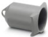
IP67 protective cover, for covering the male inserts in the sleeve housings IP67, VS-SC-RJ-..., VS-04-..., VS-06-... and VS-08-...

Protective covers - VS-SCRJ-PC - 1653757