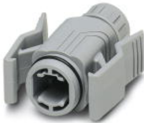
RJ45 sleeve housings, Degree of protection: IP67, Number of positions: 8, Material: PA, Cable exit: straight

Please be informed that the data shown in this PDF Document is generated from our Online Catalog. Please find the complete data in the user's documentation. Our General Terms of Use for Downloads are valid ( http://phoenixcontact.com/download )