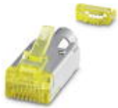
Male insert RJ45, CAT6A, 10 Gigabit

RJ45 male insert - VS-08-RJ45-10G/C - 1418853