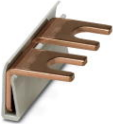
Wiring bridge for modules with connecting pitch 17.5 mm, 1-phase, 2-pos.

Please be informed that the data shown in this PDF Document is generated from our Online Catalog. Please find the complete data in the user's documentation. Our General Terms of Use for Downloads are valid ( http://phoenixcontact.com/download )