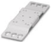
Universal wall adapter

Assembly adapters - UWA 182/52 - 2938235