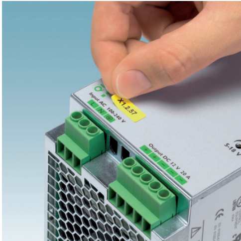
Figure may contain other products.