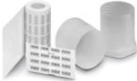
The figure shows the EML (15X9)R SR product variant

Label, Roll, silver/matt, unlabeled, can be labeled with: THERMOMARK ROLL, THERMOMARK X, THERMOMARK S1.1, Mounting type: Adhesive, Lettering field: 26.5 x 12 mm