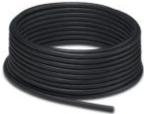
Cable ring, PVC, black, 5-pos., conductor colors: Brown / white / blue / black / green-yellow, cable length: 100 m

Please be informed that the data shown in this PDF Document is generated from our Online Catalog. Please find the complete data in the user's documentation. Our General Terms of Use for Downloads are valid ( http://phoenixcontact.com/download )