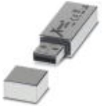
USB memory stick, 2 GB.

USB memory stick - 2 GB USB STICK - 2701382