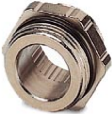
Cable screw connection support Pg16/M25, metal; for thread M25 and rubber seals of size Pg16

Please be informed that the data shown in this PDF Document is generated from our Online Catalog. Please find the complete data in the user's documentation. Our General Terms of Use for Downloads are valid ( http://phoenixcontact.com/download )