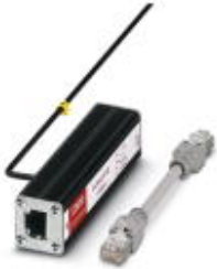
RJ-45 attachment plug with surge protection for LAN interfaces for inserting in the data line, incl. RJ45 cable

Please be informed that the data shown in this PDF Document is generated from our Online Catalog. Please find the complete data in the user's documentation. Our General Terms of Use for Downloads are valid ( http://phoenixcontact.com/download )