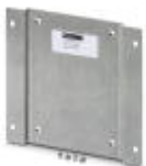
Mounting plate for SFNT switches

Mounting plate - FL PA SFNT 5-8 - 2891012