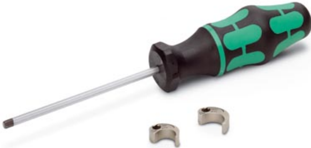
Figure may contain other products.