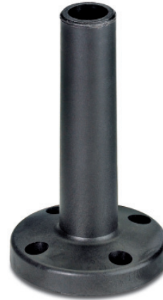
Figure may contain other products.