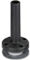
Foot with integrated tube, 110 mm long, black

Please be informed that the data shown in this PDF Document is generated from our Online Catalog. Please find the complete data in the user's documentation. Our General Terms of Use for Downloads are valid ( http://phoenixcontact.com/download )