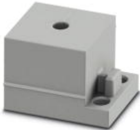
Small, slotted cable sleeves suitable for cables with a diameter of 4 ... 5 mm, material: SEBS

Please be informed that the data shown in this PDF Document is generated from our Online Catalog. Please find the complete data in the user's documentation. Our General Terms of Use for Downloads are valid ( http://phoenixcontact.com/download )