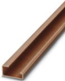
G-profile DIN rail, material: Copper, unperforated, height 15 mm, width 32 mm, length 2 m

Please be informed that the data shown in this PDF Document is generated from our Online Catalog. Please find the complete data in the user's documentation. Our General Terms of Use for Downloads are valid ( http://phoenixcontact.com/download )