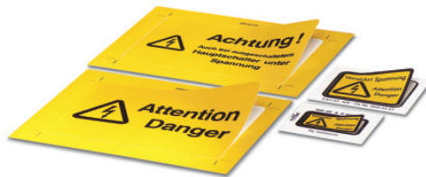
Figure may contain other products.

Phoenix Contact 2014 © - all rights reserved http://www.phoenixcontact.com