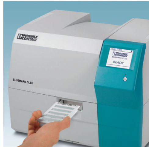
Figure may contain other products.