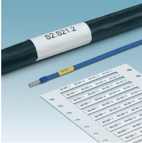
Figure may contain other products.