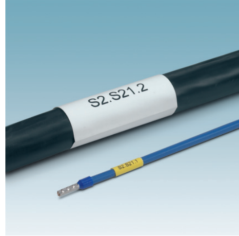
Figure may contain other products.