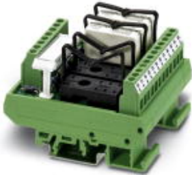
VARIOFACE module, for 4 plug-in miniature relays or miniature optocouplers, with LED, 24 V DC input voltage

Please be informed that the data shown in this PDF Document is generated from our Online Catalog. Please find the complete data in the user's documentation. Our General Terms of Use for Downloads are valid ( http://phoenixcontact.com/download )