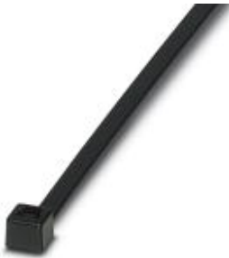
Cable binders for quick and secure bundling, standard version

Please be informed that the data shown in this PDF Document is generated from our Online Catalog. Please find the complete data in the user's documentation. Our General Terms of Use for Downloads are valid ( http://phoenixcontact.com/download )