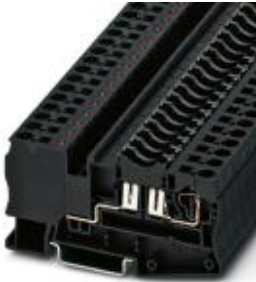
Fuse terminal block with LED for mounting on NS 35, for miniature circuit breakers, terminal width: 8.2 mm, color: Black

Please be informed that the data shown in this PDF Document is generated from our Online Catalog. Please find the complete data in the user's documentation. Our General Terms of Use for Downloads are valid ( http://phoenixcontact.com/download )