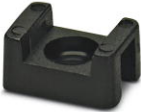
Cable binder base, for cable binders up to 9 mm wide, screwable, 5 mm fixing hole, 2-sided cable binder feed-through

Please be informed that the data shown in this PDF Document is generated from our Online Catalog. Please find the complete data in the user's documentation. Our General Terms of Use for Downloads are valid ( http://phoenixcontact.com/download )