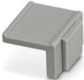
Equipment marker, width 12 mm

Please be informed that the data shown in this PDF Document is generated from our Online Catalog. Please find the complete data in the user's documentation. Our General Terms of Use for Downloads are valid ( http://phoenixcontact.com/download )