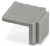
Equipment marker, narrow

Marking material - EMG-SGKS 10 - 2947585