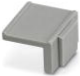
Equipment marker, width 12 mm