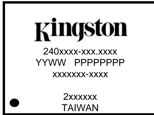
Figure 4 - EMMC Package Marking